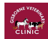
Gisborne Vet Clinic