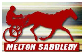
Melton Saddlery – Champion Rider/s