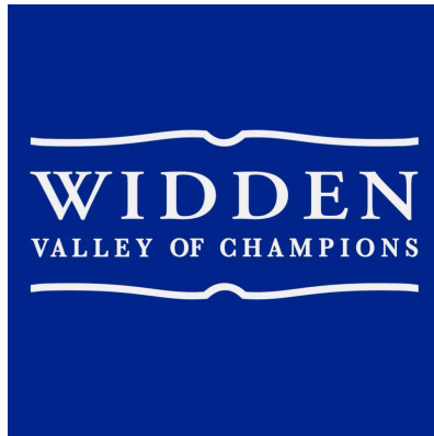
Widden Victoria – Supreme Show Horse

A big thank you to our amazing sponsors!